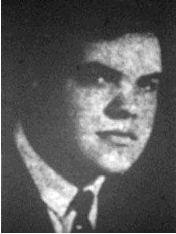
Initially Listed Missing In Action